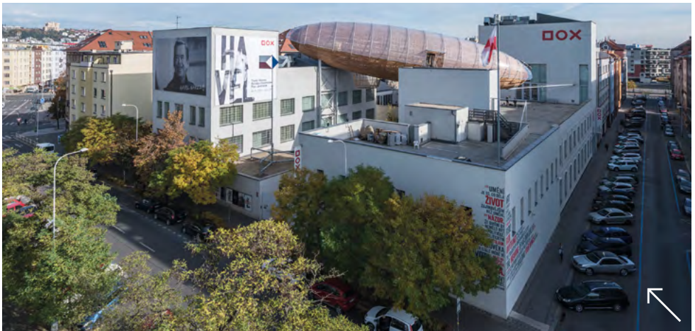
DOX Centre for Contemporary Art