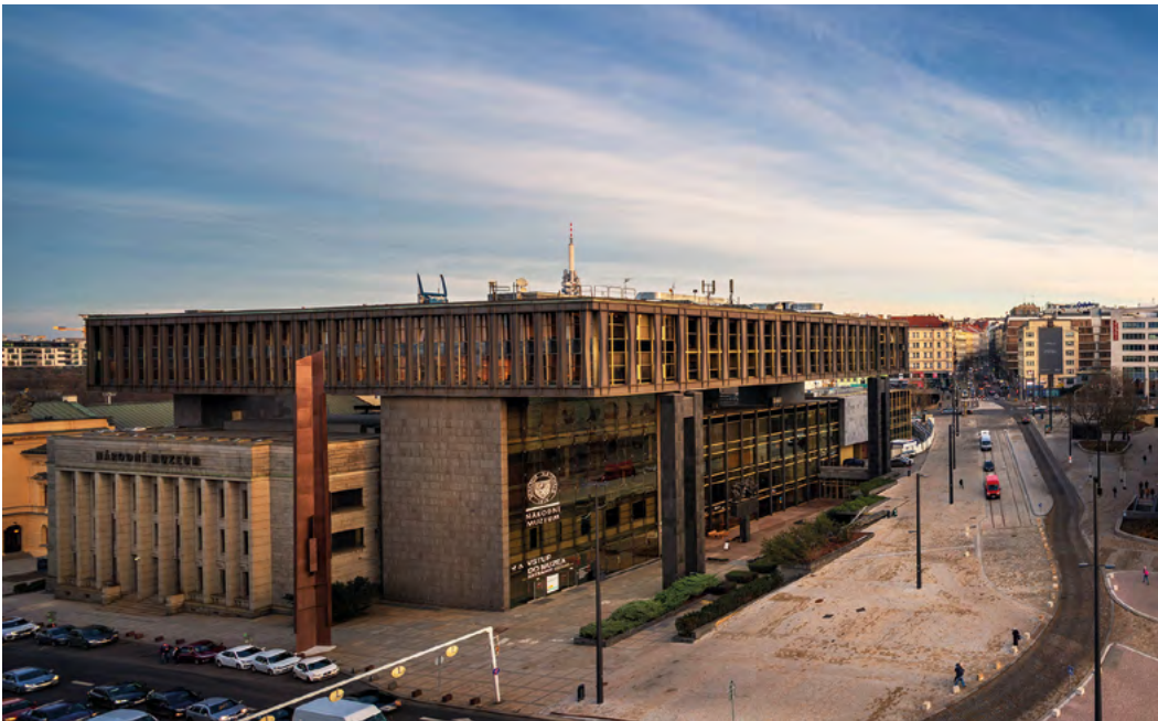
Museum Complex of the National Museum