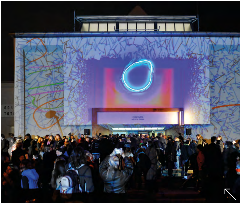
House of Arts Brno