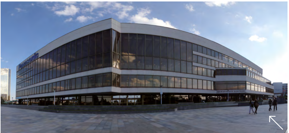
Prague Congress Centre

Conference participants will pay a registration fee of a basic amount of 350 EUR for onsite and 150 EUR for remote attendance.