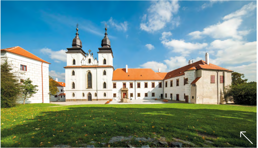
← Vysočina Museum Třebíč