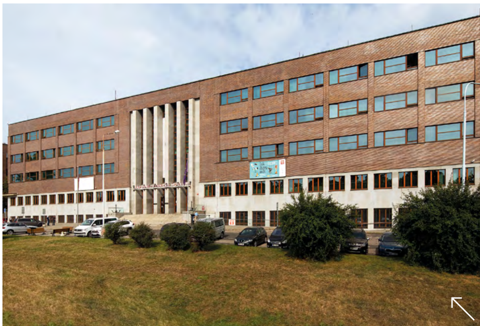
National Technical Museum

ICOM international council of museums Czech Republic