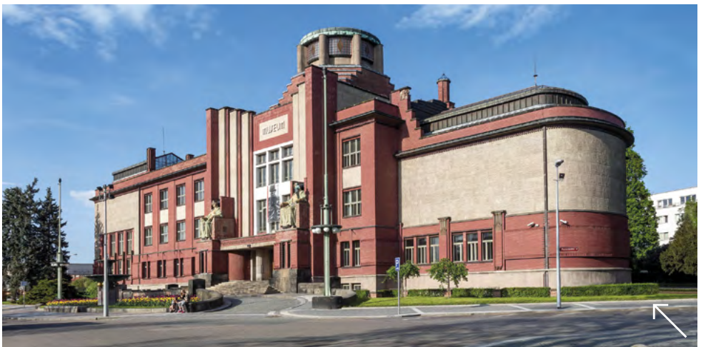
Museum of Eastern Bohemia in Hradec Králové