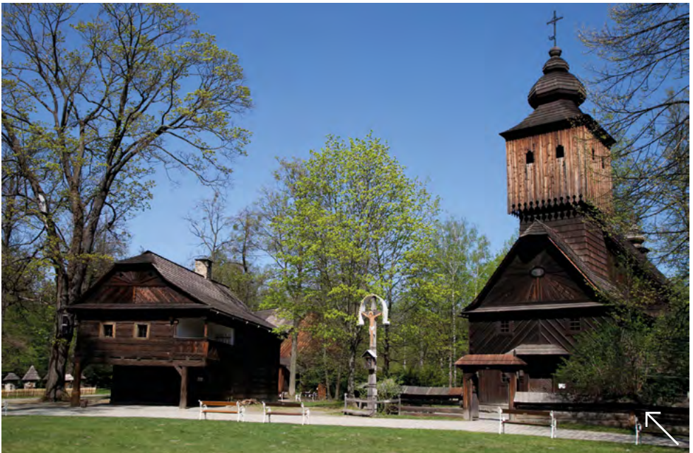
National Open Air Museum